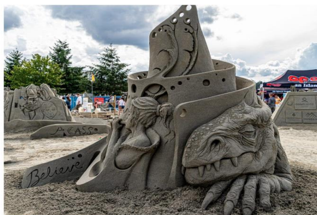
Parkville Beach Fest Sand Sculpting Competition (Photo from