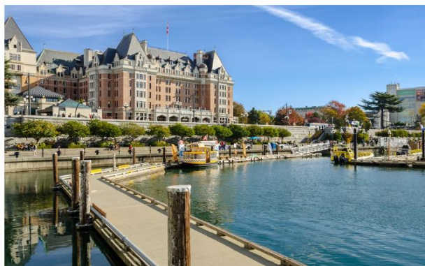
Inner Harbour of Victoria Harbour