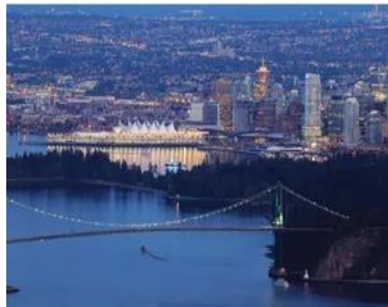
Vancouver: Lions Gate Bridge Lions Gate Bridge, crossing the First Narrows of Burrard Inlet, Vancouver, British Columbia, Canada.