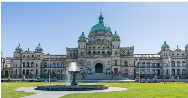
Vancouver Parliament Building