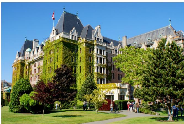
Fairmont Empress Hotel