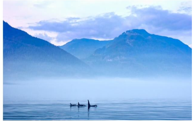
Three killer whales off the shores of Vancouver Island