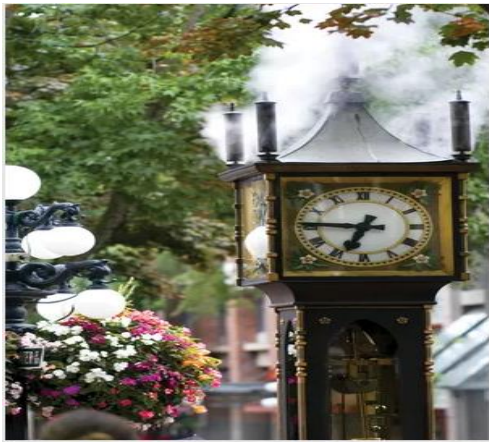
Vancouver: Gastown The Gastown Steam Clock in the historic Gastown section of Vancouver, British Columbia, Canada.