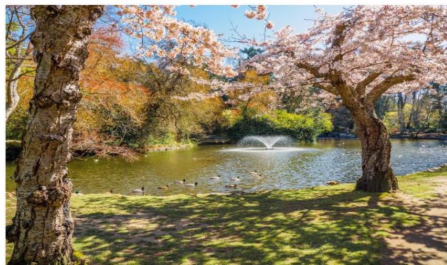
Beacon Hill Park in springtime