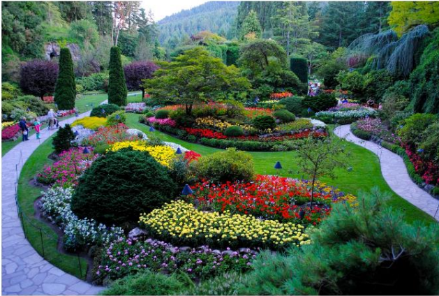
Butchart Gardens, one of the many treasures on Vancouver Island for families