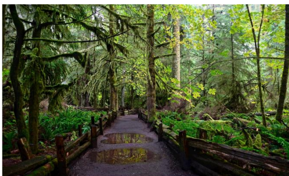
Old growth forest in Cathedral Grove Provincial Park