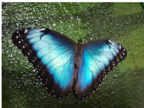
Victoria Butterfly Gardens