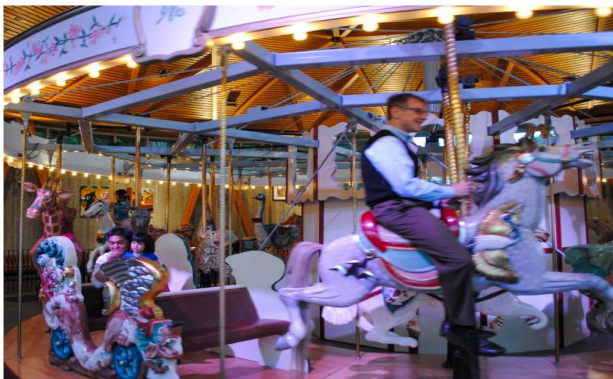
Rose Carousel at Butchart Gardens