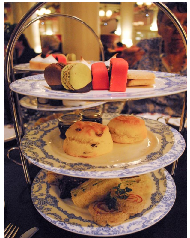
After tea at the Fairmont Empress